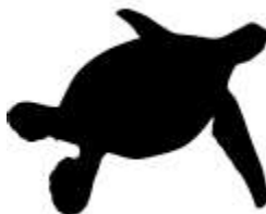
GREEN_SEA_TURTLE1_ GREEN_SEA_TURTLE2_ GREEN_SEA_TURTLE3= GREEN_SEA_TURTLE4_